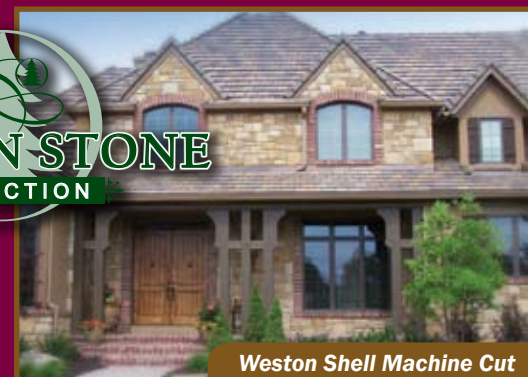
Weston Shell Machine Cut