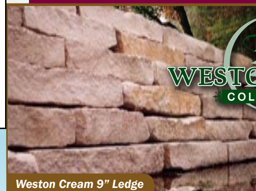
Weston Cream 9" Ledge

Introducing the Semco Weston Stone Collection